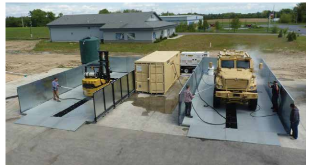
Typical application of Water Blaster with dual wash bays

The Water Blaster is ideal for pre-wash operations where it automatically draws water from a collection pit, filters it through an inline strainer and sends it back to the Water Blaster for reuse in knocking off caked-on mud.