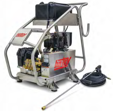
Diesel Model HHD 3.4/30 D with stainless steel frame

50-ft. high-pressure hose for easy maneuverability around a large working area